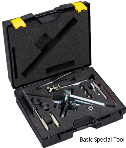
Basic Special Tool

Schaeffler Automotive Aftermarket develops and offers the necessary tools and repair procedures for the professional double clutch replacement and educates mechanics with technical seminars on the professional repair and handling of these new clutch technologies.